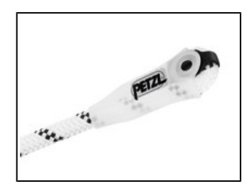
GRILLON lanyards are sold without connectors, so that they can be combined with any type of connector, depending on the user's requirements.

The GRILLON adjustable lanyard is used to make work positioning systems, to complement a fall-arrest system. Its length can be very easily and precisely adjusted as necessary for comfortable positioning at the work station. Depending on the configuration, it can be used in single or double mode. GRILLON is available in two colors and seven lengths (2, 3, 4, 5, 10, 15 and 20 m). It is certified to North American, European and Russian standards.